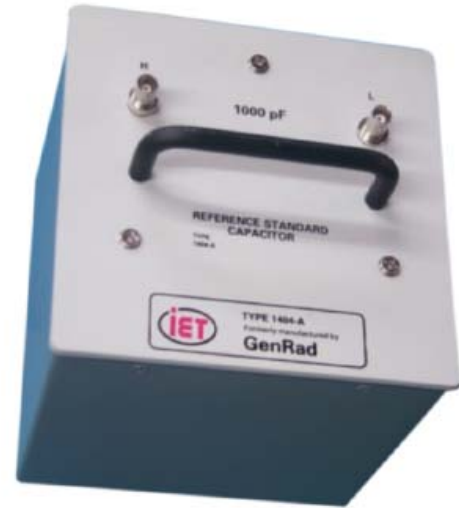
Model 1404 Standard Capacitor

In combination with an accurately known external resistor, this capacitor also becomes a standard of dissipation factor.